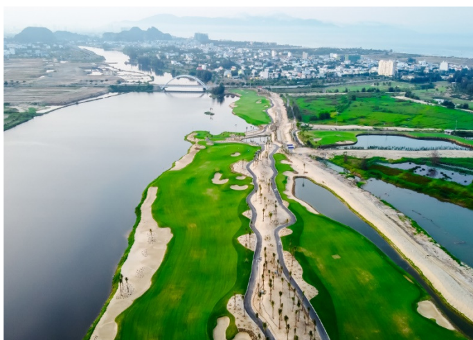
Hoiana Shores designed by Robert Trent Jones Jnr