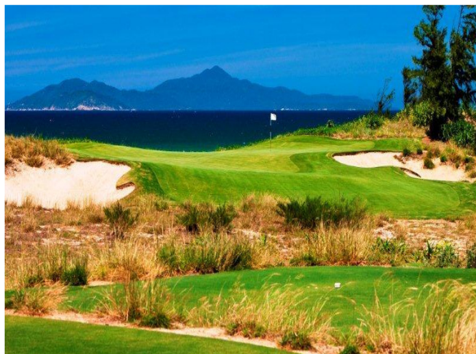
Da Nang Golf Club designed by Greg Norman