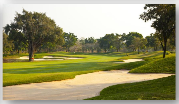
Nikanti Country Club Bangkok