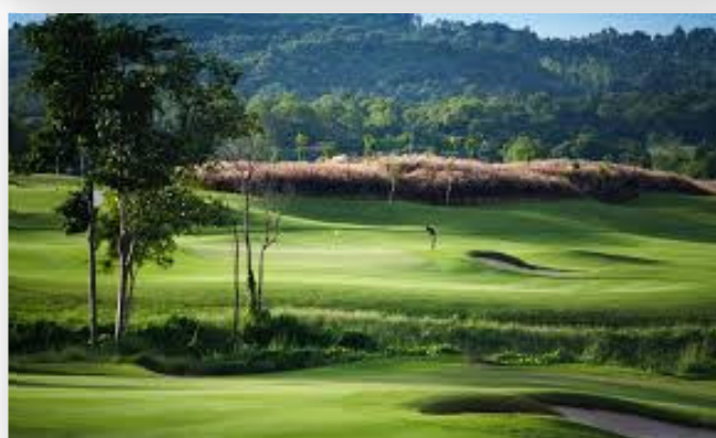
Siam Country Club - Plantation