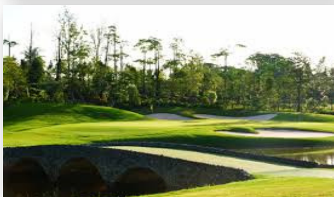
Royal Gems – Dream Arena